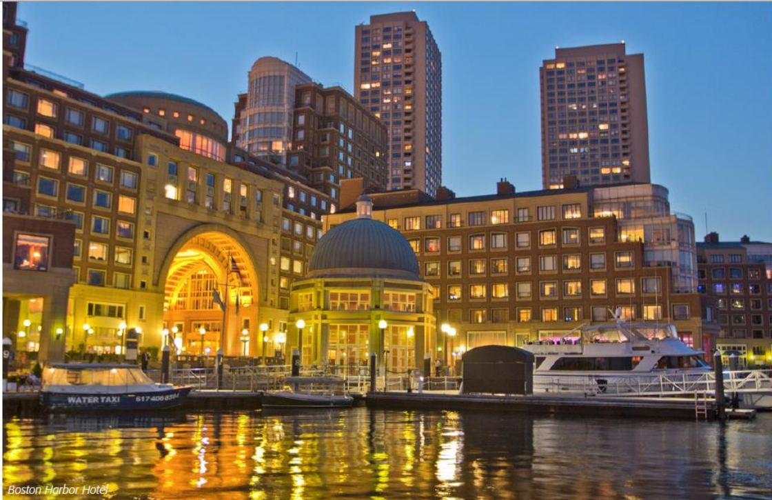
Boston Harbor Hotel

unique welcome options such as Vermont goodies or small touches throughout the resort that tie the wedding theme together.