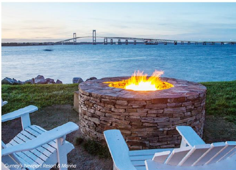
Gurney's Newport Resort & Marina