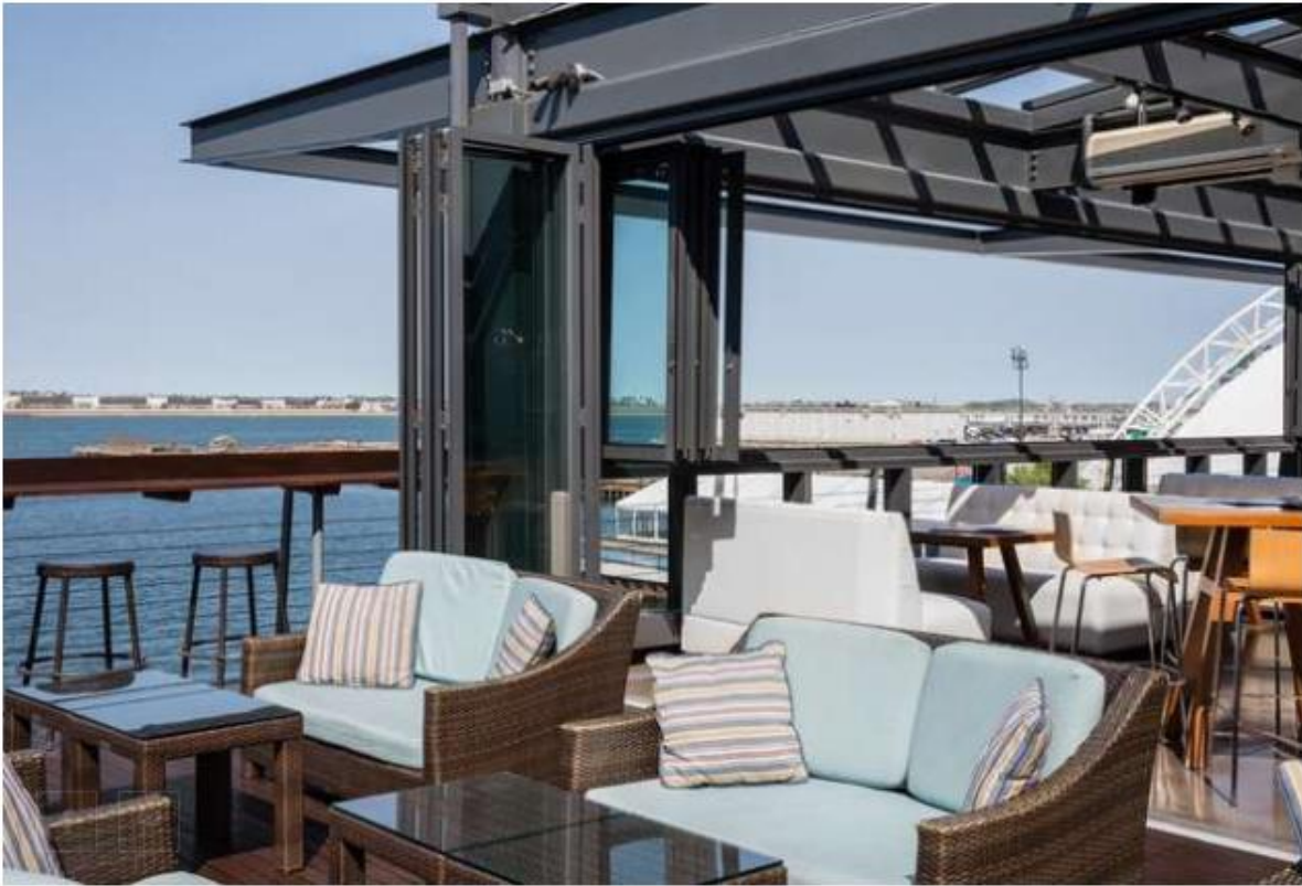
Legal Sea Foods