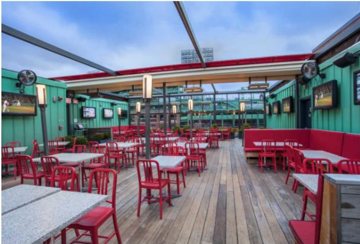
Tony C's Fenway